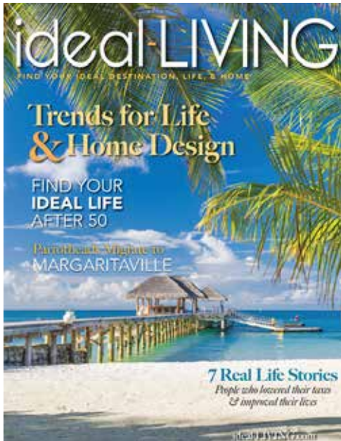
2020 Trends in Planned Communities and Home Design