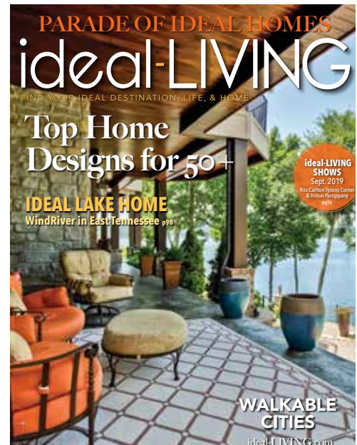
2020 Ideal Parade of Homes