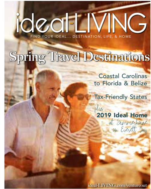
Spring Travel Destinations